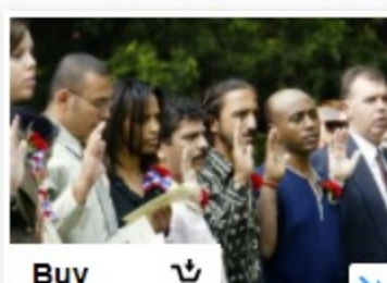
Buy Photo (Photo: Adriane Jaeckle / The Tennessean)

Want to submit your letter to the editor? Here is how. Wochit